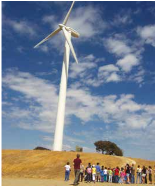
School groups learn about wind energy.

Three-armed sentinels dot the hills of Pacheco State Park, providing clean energy for homes across the state. The eastern portion of the park is leased to a commercial venture that operates wind power plants