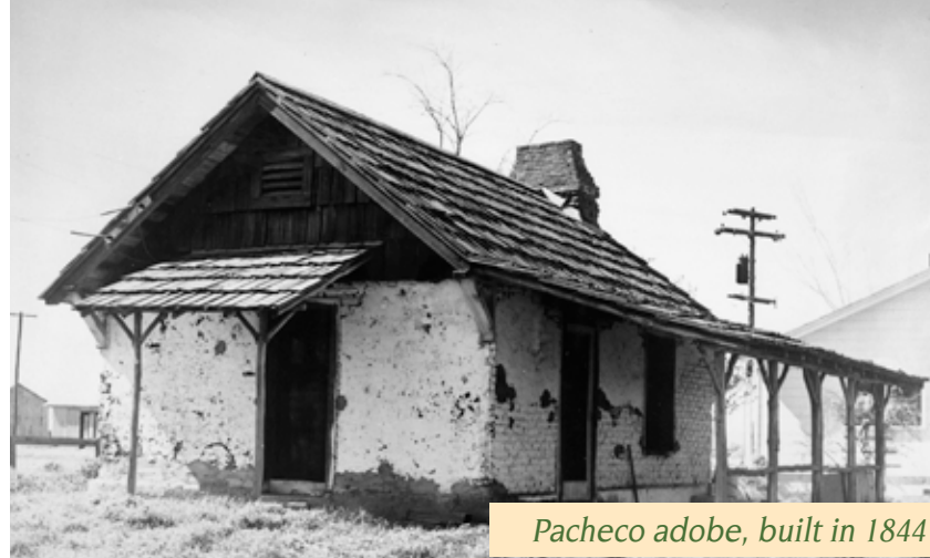
Pacheco adobe, built in 1844

Pacheco Pass is strategically located at the edge of the Diablo Range, providing a vital