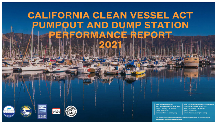
The 2021 California Clean Vessel Act Pumpout and Dump Station Performance Report. Report Design: All My Sisters.

California State Parks Division of Boating and Waterways Clean Vessel Act Education Program and a Federal Clean Vessel Act grant through the Sport Fish Restoration Program fund this report. The report is produced by The Bay Foundation, San Francisco Estuary Partnership and the California State Parks Division of Boating and Waterways (DBW).