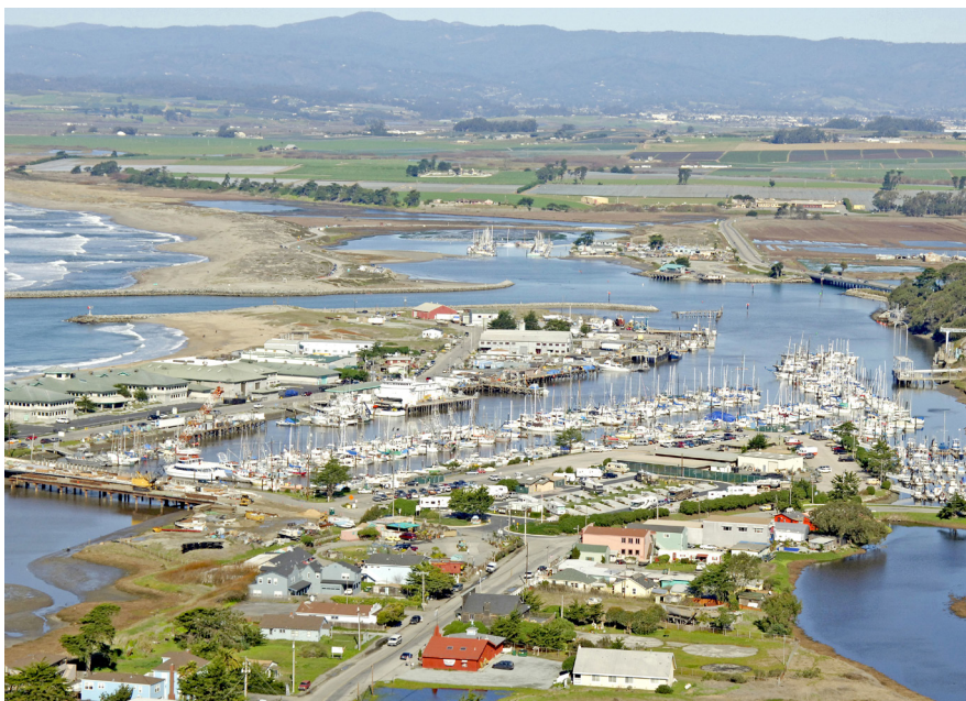
Moss Landing Harbor and Elkhorn Slough.

Slough National Estuarine Research Reserve. Explore the sights and sounds of the Monterey Bay National Marine Sanctuary by kayak, boat or even on the shore, where you'll observe playful sea otters, harbor seals, seabirds and local marine life. No matter the time of year, Moss Landing Harbor District makes for an excellent stop off or extended stay along the beautiful California coastline.