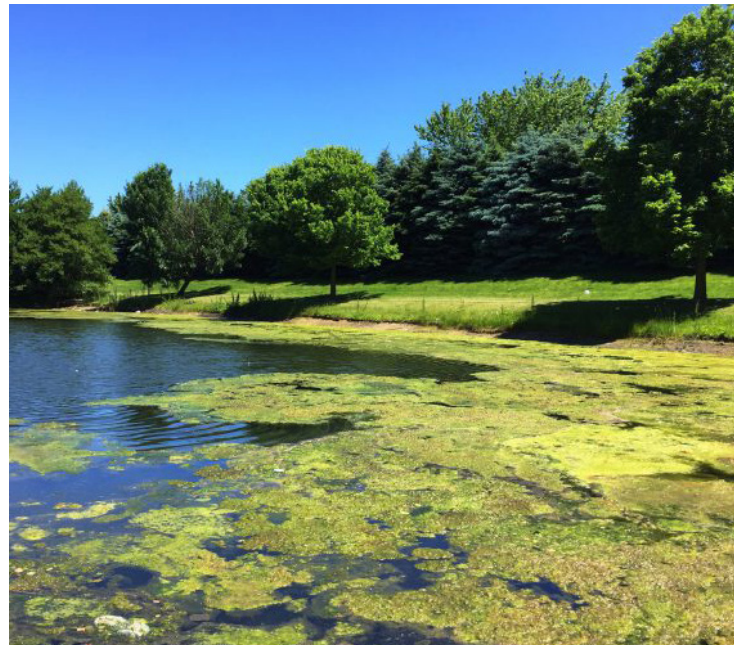
Brightly colored harmful algal bloom.

How does this connect to boating beyond navigating through safe waters? One potential cause of harmful algal blooms is discharged boat sewage. Dumping sewage impacts levels of nutrients in our waterways and helps to create ideal water conditions for the algae to bloom. To prevent these harmful blooms, it's important to never discharge treated or untreated sewage into small bays, harbors, marinas, swimming or fishing areas, areas with low tidal flushing or near shellfish beds. Also, if your marine sanitation device (MSD) is equipped with a y-valve for overboard discharge, make sure it is secured in the closed position while